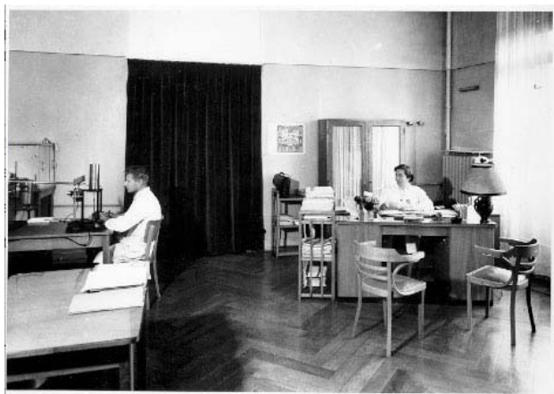
Figure 7. Marguerite Perey (right) with Jean-Pierre Adloff (left) seated at the Quadrant Electrometer Used in the Discovery of Francium, 1952.

media, for example, “with francium cancerous tumors can be detected at an early stage” [22, 23].