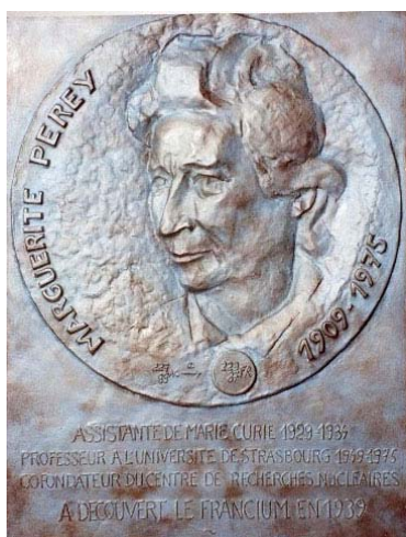
Figure 11. Bronze Tableau in Front of the Auditorium of the Nuclear Research Center in Strasbourg. The decay of actinium to francium is depicted.