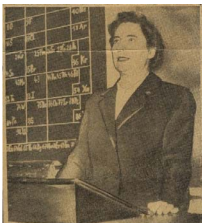
Figure 6. Inaugural Lecture of Marguerite Perey in the Auditorium of the Institut de Chimie, Université Strasbourg, November 8, 1949. A specially drawn periodic chart emphasized the positions of francium and other radioelements.

at the Université Strasbourg; she simultaneously became the Director of a newly created associated laboratory. This unexpected and extraordinary promotion in such a short time after her thesis was probably helped by the intervention of university and academy members who befriended her. Previously, the only Chair of Nuclear Chemistry was that of 1935 Nobel chemistry laureate Frédéric Joliot (1900–1958), Marie Curie's son-in-law, at the prestigious Collège de France in Paris, and Perey's new position certainly contributed to her fame and reputation. Perey later commented,